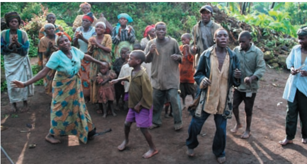
Twa-Batwa pygmies in Western Uganda.

The Political Conditions: The political situation on the continent continues to concern me. Relief organizations continue to pour funding into the hands of politicians but there is still very little trickle down effect to the African people. In the remote areas that we travelled, lawlessness is never far off the beaten path.