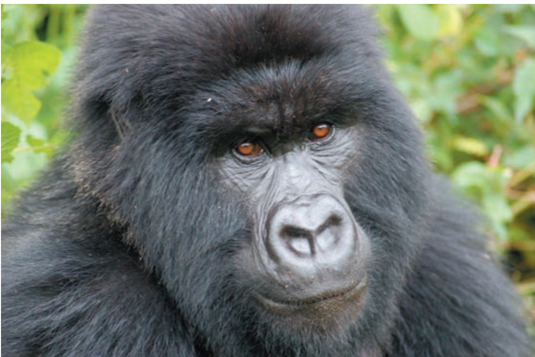
Mountain gorilla in the Parc Nacional des Volcan in Rwanda, Central Africa